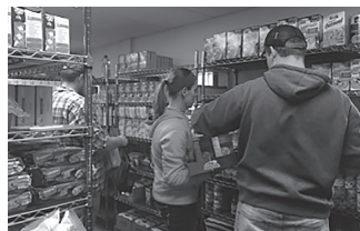
Lexington Community Church

East White Oak Bible Church has had food drives for Ministry and More, Inc. in January and March already this year. It's always a blessing to see our friends, and family, at the food drives at East White Oak. East White Oak has been a faithful partner since the pantry's beginning. We are thankful for their commitment to Ministry and More, Inc.