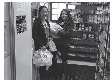
Senior students from Calvary Christian Academy.