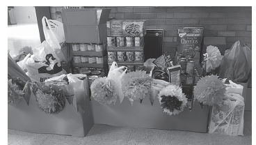
Month long food drive by Our Redeemer Lutheran Church.

In April we will see the results of an enthusiastic food drive by Our Redeemer Lutheran Church. Church members will be dropping off the results of a month long food drive! Thank you to all who support Ministry and More, Inc. and our vision, to provide nourishment for the physical and spiritual needs of those whom we serve.