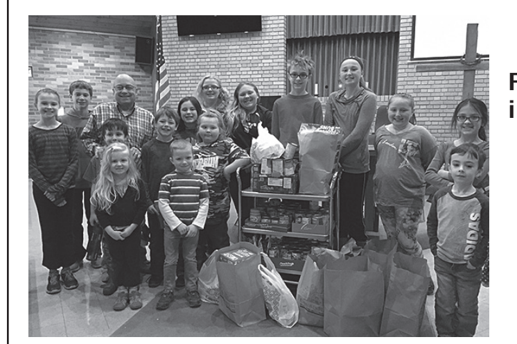
Food drive at Grace Christian School in Pontiac