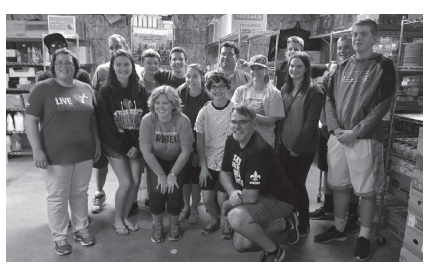
continued on page 2

This fall youth groups from some of our supporting churches provided much