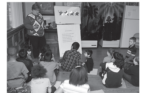
Children's Christmas party.

attended accepted Christ as Lord and Savior! It was a wonderful experience for us to be a part of that event. We also saw 16 of the children sign up for the Child Evangelism Bible study, and the parents of those children signed up for the adult version of the study! That is such a victory for Christ. We are planning on doing a similar children's