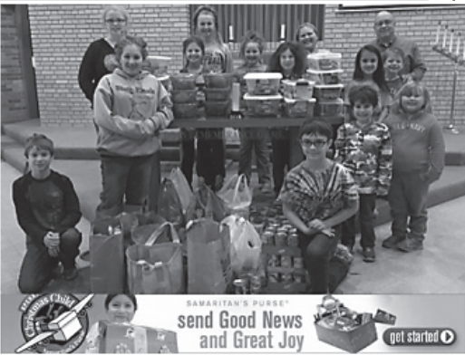
Food drive at Grace Christian School located in Pontiac, Illinois.