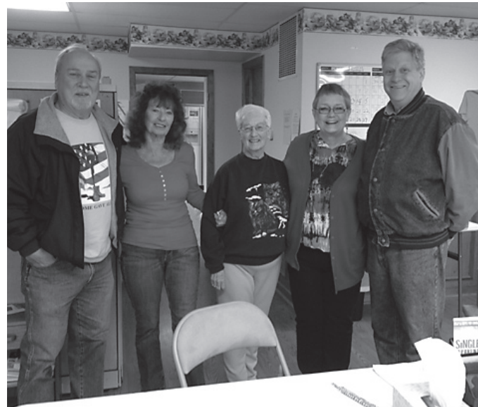
Monday volunteer team.