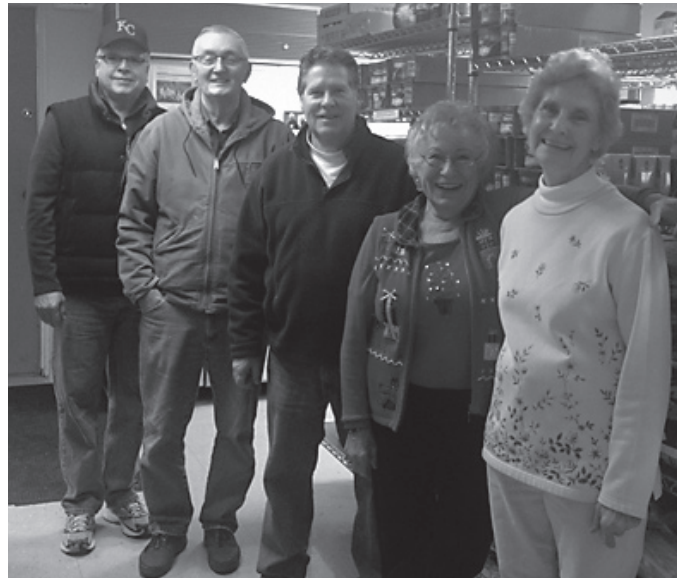
Wednesday volunteer team.