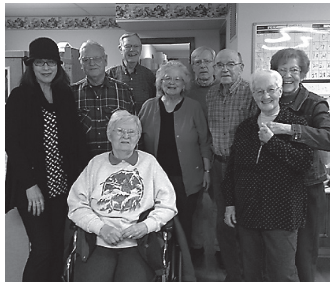
Tuesday volunteer team.