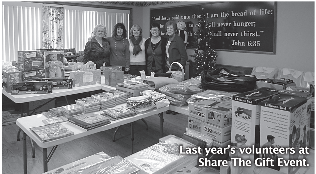
Last year's volunteers at Share The Gift Event.