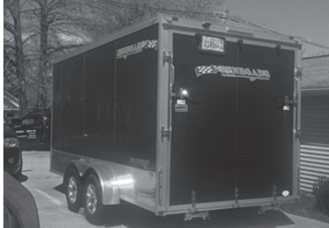
God continues to amaze us at the pantry. Shown here is our new 18 foot trailer!

God continues to amaze here at Ministry and More, Inc. Recently I received a call from a friend stating that he had a trailer to donate if we had a need. I have never made this need known to anyone outside the ministry, but God knew, and made the offer available to us. It is a 2007 18 foot trailer